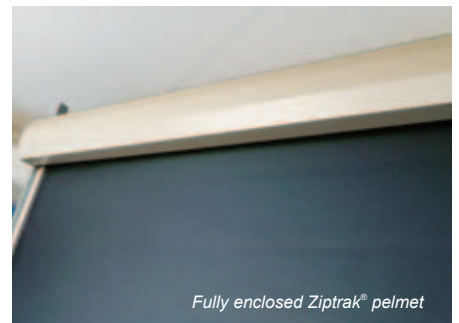
Fully enclosed Ziptrak® pelmet