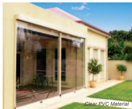
Clear PVC Material