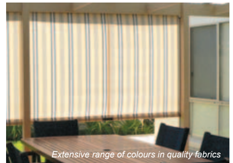
Extensive range of colours in quality fabrics

Discover a simpler way to shade and protect your outdoor way of life.